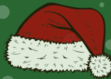
Photo with Santa Create a Frame for your Photo Make a Card to Send to a Veteran Decorate Cookies

Sunday, December 5th 1 p.m. to 3 p.m. Cumming American Legion 117 N 44th St