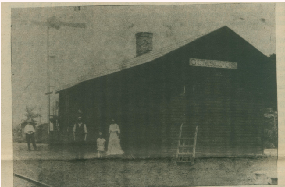
Depot at Cumming, IA on the Chicago Great Western Railway. Year unknown. The railway began in 1888, as did the town.

In this picture below of the old railroad station the name of our city is listed as "Cummings." Wait.. what? Why is there an 'S' at the end of our name? Find out why on page 5.