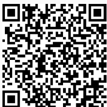
Scan to take the survey

For more details on upcoming activities, go to the City of Cumming's Facebook page for more details.