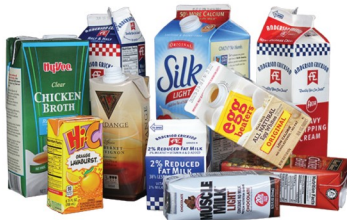
Paper Food Cartons (no caps) (not cylinder shaped)