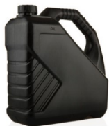
Containers for Hazardous Materials