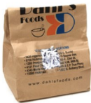
Shredded Paper (Place in a paper sack or box)