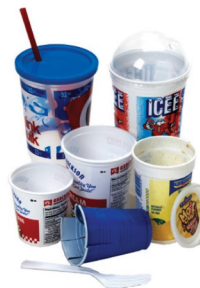
Plastic Cups & Tubs, Lids & Utensils