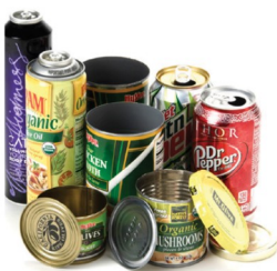
Aluminum, Tin & Empty Aerosol Cans