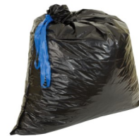
Garbage or Yard Debris

Follow the same guidelines you do at home for the Curb It! residential program.