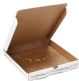
Food Contaminated Items (Pizza boxes, paper plates, napkins)