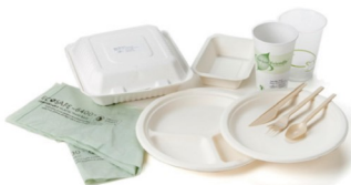
Compostable Cups, Plates, Utensils & Bags