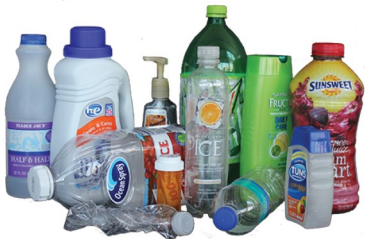
Screw-Top Plastics (with caps) & ONLY Yogurt & Margarine Tubs (no lids)