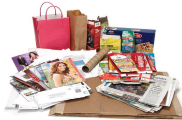
Mixed Paper (Junk mail, phone books, envelopes) Cardboard (Break down and cut to fit into cart)