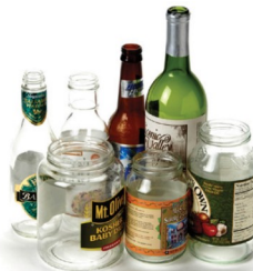
Glass Jars & Bottles (All colors)