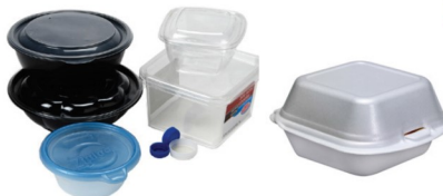
Plastic & Styrofoam Food Containers, Lids & Loose Caps