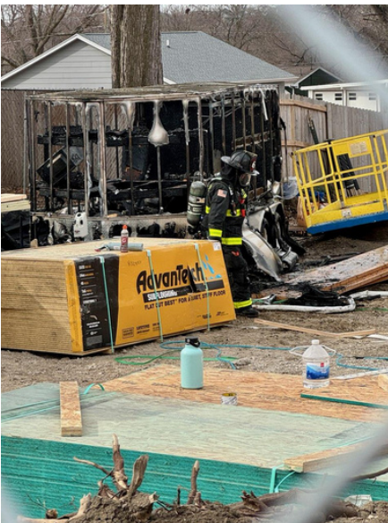
On February 19th the Norwalk Fire Department responded to a construction trailer fire at 721 Jackson St.